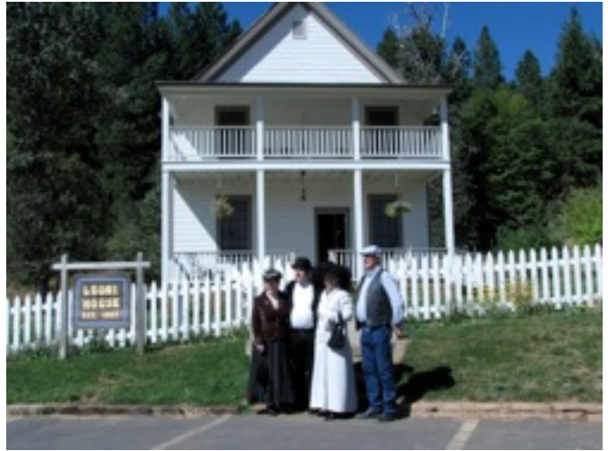
Leoni House Museum.