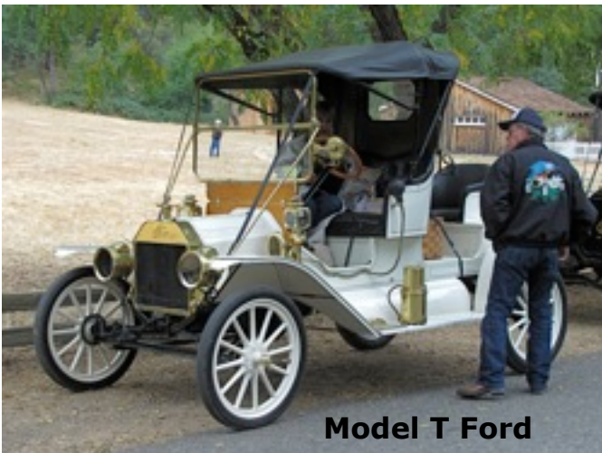
Model T Ford