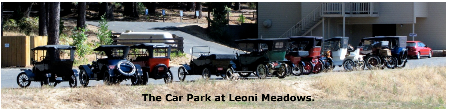
The Car Park at Leoni Meadows.