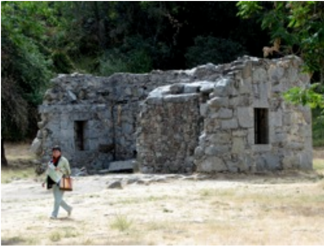
Jail house ruins at Coloma.