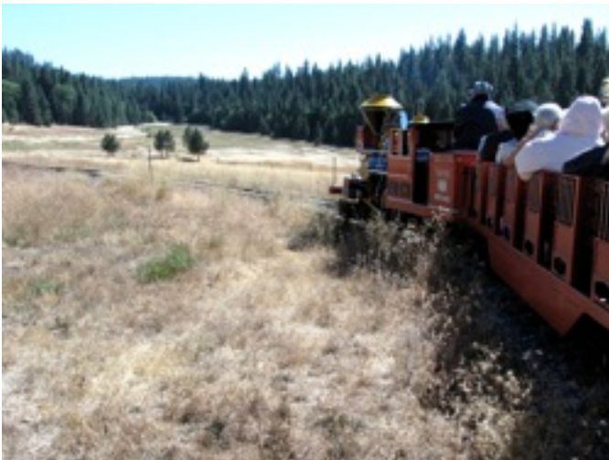
Riding the Rails at Leoni Meadows.