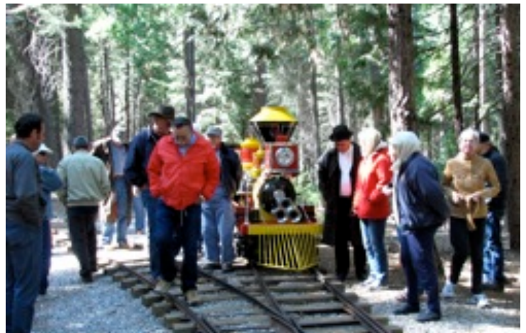
Searching for the Golden Spike.