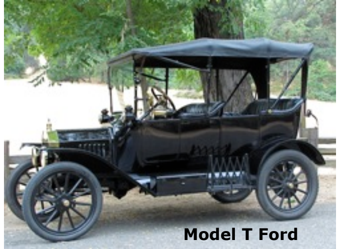
Model T Ford