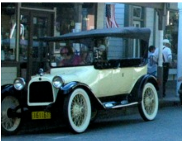
Post -16 Peoples Choice, Pre-16 Peoples Choice, and the Hard Luck car