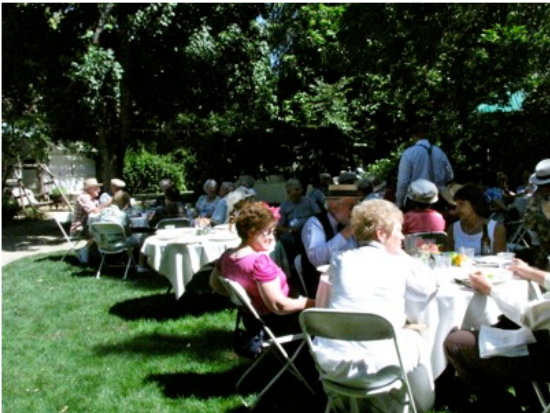
Lunch at the St. George Hotel in Volcano, California