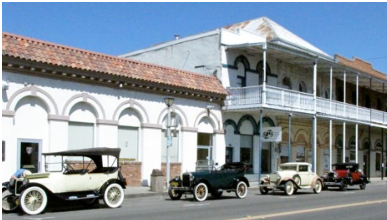
Main Street of Old Lone