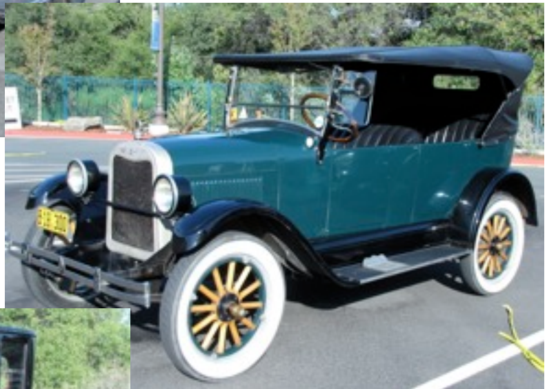
Model T Ford with Hollywood bullet holes