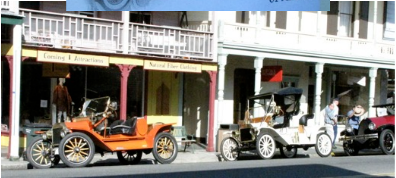
Reserved Parking on the Main street of Sutter Creek